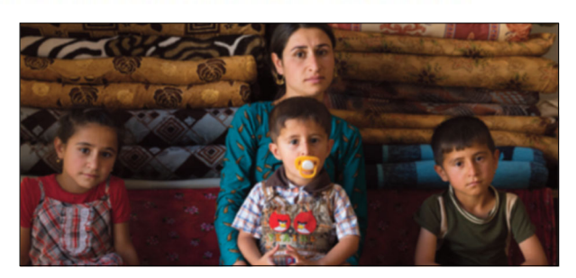
National Migration Week: "Many Journeys, One Family" January 7–14, 2018

Office of Human Dignity & Solidarity-Immigration Ministry